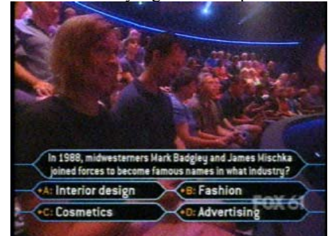
The two of us on Who Wants to Be a Millionaire.