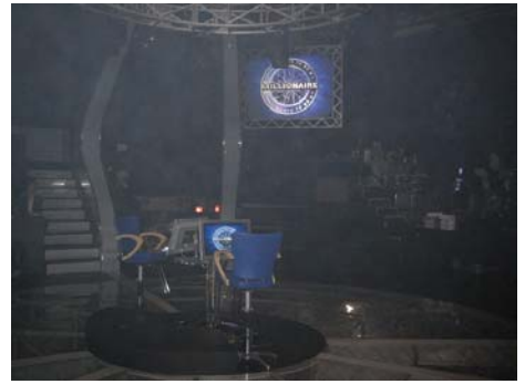
Who wants to be in the hot seat? See Travel.

All the news that's unfit for publication elsewhere