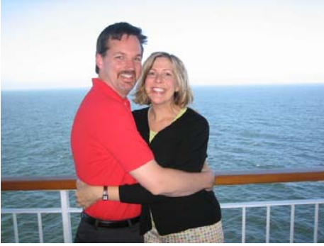
North, to Alaska! See Travel.